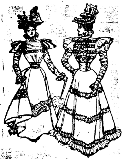
CLASSY LAWN GOWN, WASHING SILK.

The summer fabric known as "washing materials" have rarely been more tempting or artistic. All the beautiful designs in foulards have been reproduced in lawns, muslins and other translucent stuffs.