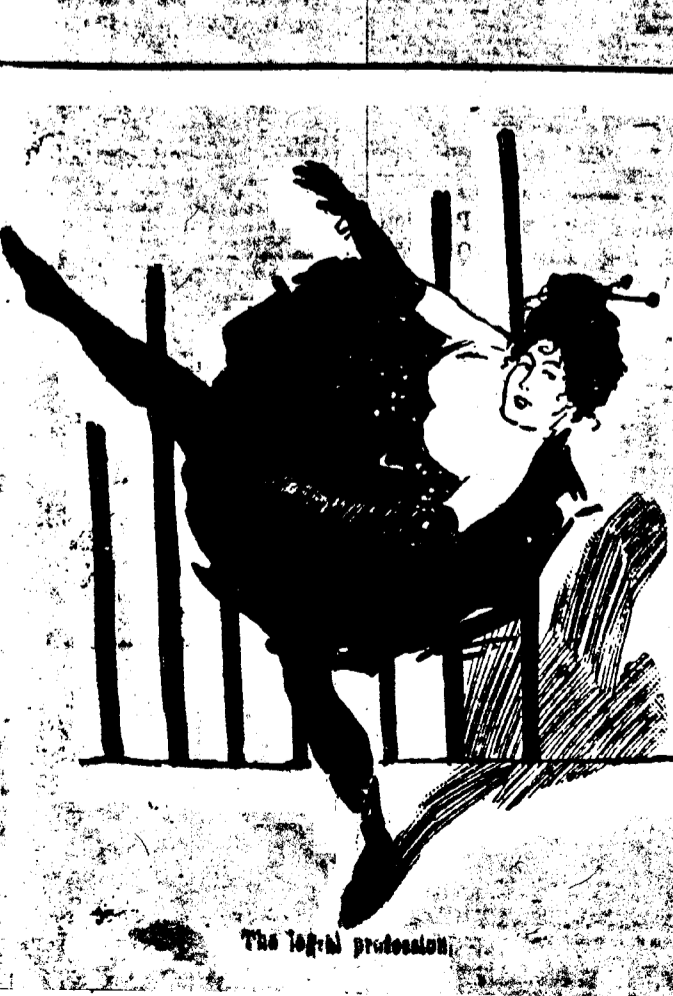
The fatal profession.

"Well," greeted the father, when the suitor appeared in his presence.