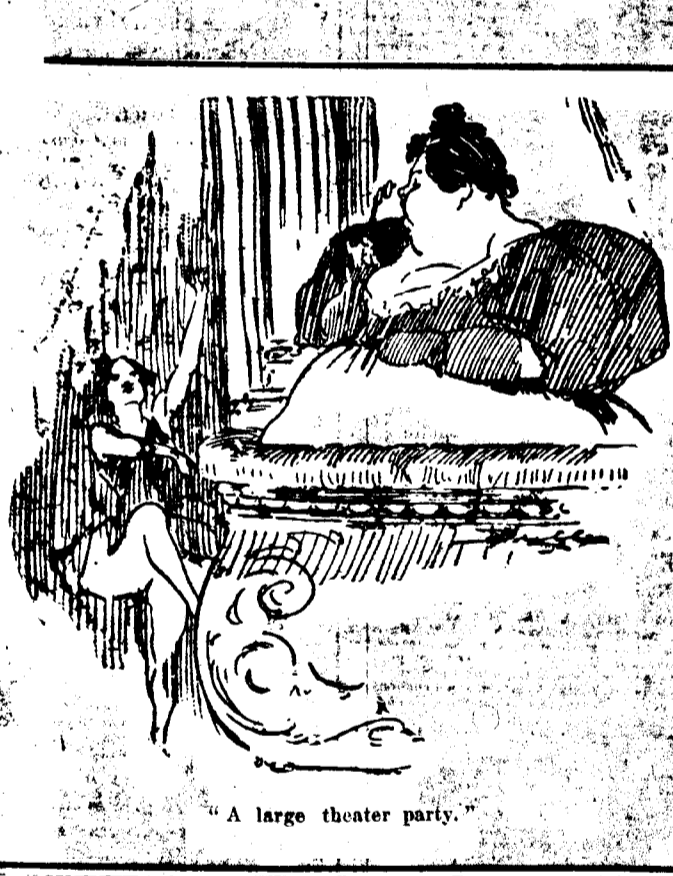
A large theater party.