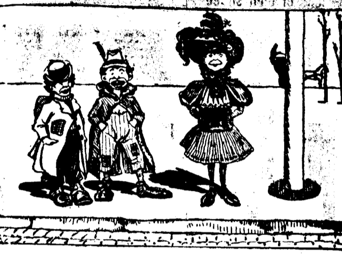
Whimpy: "Wot's do matter wid her, Swispey?"