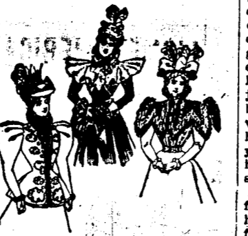
TYPES OF WINTER STYLES.

COUR CIVILE DE DISTRICT POUR LA PAROISSE D'ORLÉANS. COUR CIVILE DE DISTRICT POUR LA PAROISSE D'ORLÉANS. COUR CIVILE DE DISTRICT POUR LA PAROISSE D'ORLÉANS.