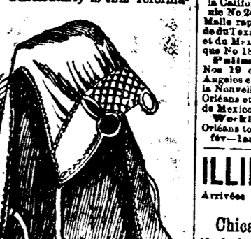
Evening Gown and Wraps.

tion to be commended in the exclusion of the open day shirt for the vest of fine knit or woven wool. The former, though in no doubt pretty and dainty in appearance, but its comfort is much to be questioned. The woven vest—and of course only the very best quality should be used—may be described as an ideal shirt, as it contains the minimum of weight and the maximum of warmth.