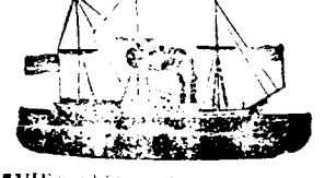
Illustration of a steamship, likely used for shipping goods or passengers.

FOR SALE: A large lot of land, situated in the parish of St. Charles, Louisiana, containing about 100 acres, and bounded on the north by the parish of St. Louis, on the east by the parish of St. James, on the south by the parish of St. Bernard, and on the west by the parish of St. John the Baptist. The land is well adapted for planting sugar cane, and is now being cultivated by the late owner. It is offered for sale at a very low price, and is a rare opportunity for any person desiring to purchase a large tract of land in Louisiana. For further particulars, apply to the undersigned at No. 110, Chartres Street, New Orleans.