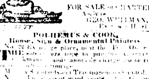
Illustration of a steamship, likely used for shipping goods or passengers.